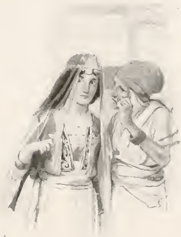
The slave whispered her plan in the Sultana's ear (p. 100.)

For reply Omar flung the roll of silk and scissors upon the floor. "I was taught to manage